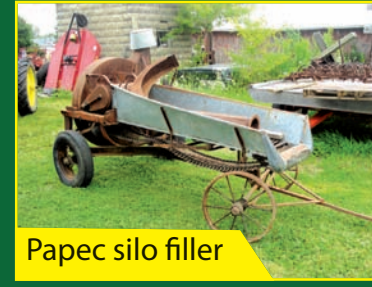
Papec silo filler