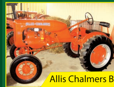
Allis Chalmers B