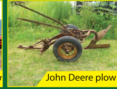
John Deere plow