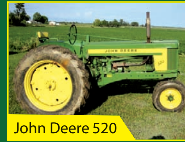
John Deere 520