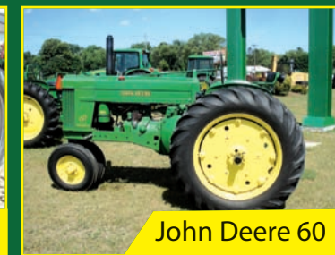
John Deere 60