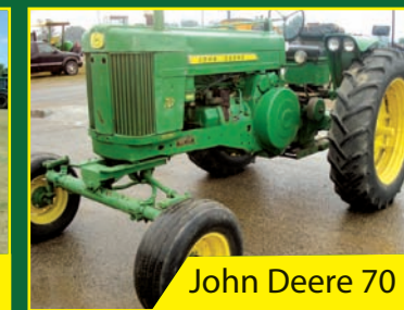
John Deere 70