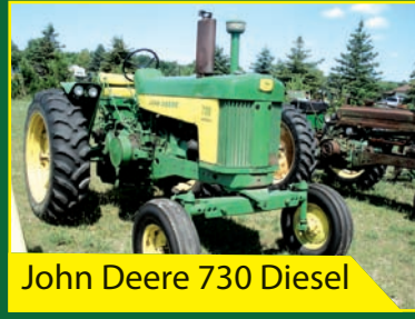
John Deere 730 Diesel