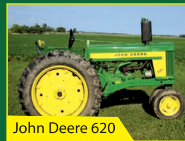
John Deere 620