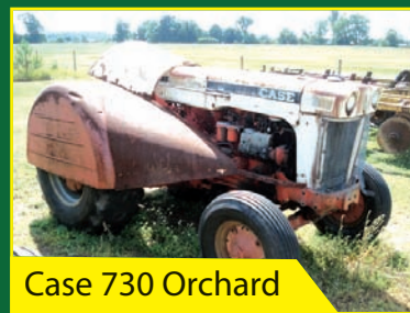
Case 730 Orchard