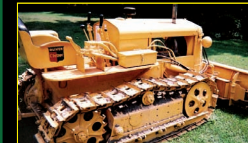
Oliver Cletrac AG6

Voelker Implement Sales Big Rapids, MI 1-800-526-6262