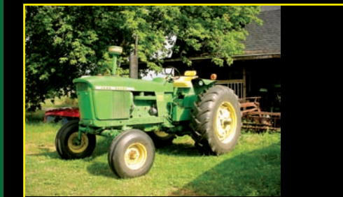
John Deere 4020