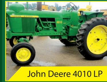
John Deere 4010 LP