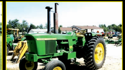
John Deere 4320

Voelker Implement Sales Big Rapids, MI 1-800-526-6262