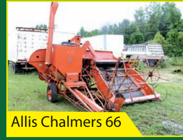
Allis Chalmers 66