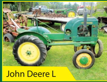
John Deere L