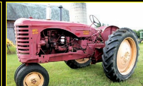
Massey Harris 44D Special