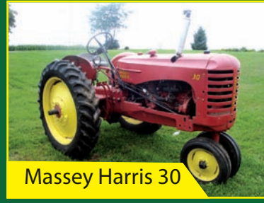
Massey Harris 30