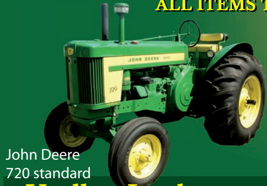
John Deere 720 standard