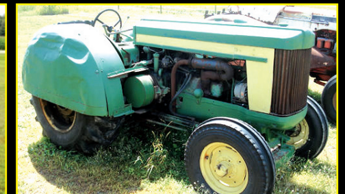
John Deere 620 Orchard