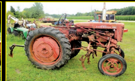
Farmall 100 High Clearance