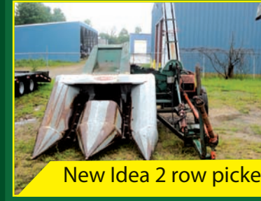
New Idea 2 row picker