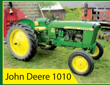
John Deere 1010